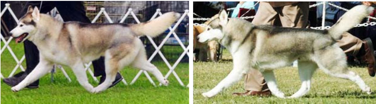
These are pictures of the same dog. Notice how in the left-hand picture, the body looks compressed due to the inside legs meeting. With the inside legs at full extension, the picture at the right is a much more appealing one.

The first rule of movement photography is to select those pictures where the "inside legs" of the dog (the legs closest to the photographer) are at full extension.