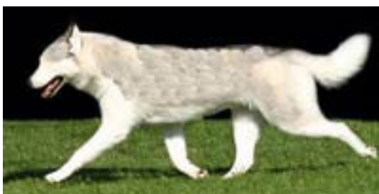
This picture shows a dog "under reaching." Notice how the forefoot and hindfoot do not meet under the dog's body. The rear leg at full extension seems to be kicking up. Also, if your dog is long of body, perhaps a side movement shot is not the best for your dog, as he may appear even longer.

Next, be very critical when looking at moving pictures.