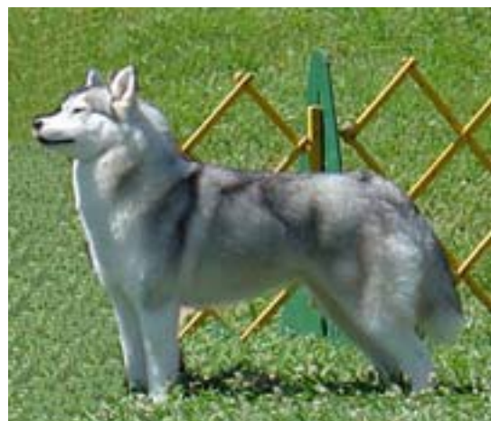
A short-legged, straight fronted dog should not be photographed in full profile, and especially not in long grass.)

Where the photographer is with respect to your dog matters. An inch or two high, low, to the left or right can all affect the picture that is taken of your dog. If your dog is short on leg, a high-held camera will make his legs look even shorter. A long-backed dog, if photographed in full profile will seem much longer. A dog lacking underjaw will not look good with his head in profile. A dog with a poor earset will not appear his best if looking straight at the camera. A dog's straight front will be made all the more noticeable with a full profile shot. The placement of the dog and the photographer matter when it comes to making your dog look his best.