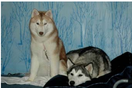
Logan kept stealing Salsa's bed.

As the show came to a close on Sunday we all headed home exhausted but content in the fact that we were able to spend the weekend talking to folks about this breed that we love so well. Letting people know the pros and cons of living with these wonderful dogs.