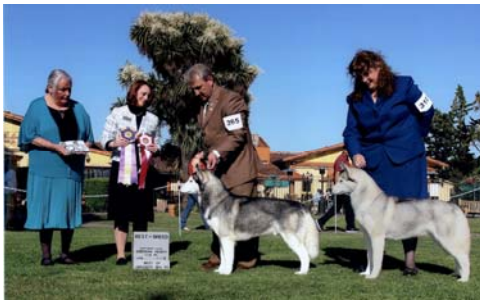
Best of Breed and Best of Opposite Sex

The Northern California Siberian Husky Club held its Fifteenth and Sixteenth Biennial Specialty Shows, Seventh Sweepstakes and Second Back to Back Shows on April 26th and 27th.