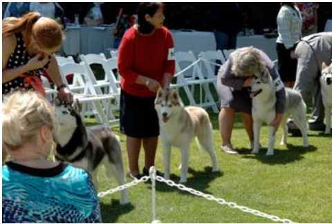
Bred by Exhibitor Dog Class