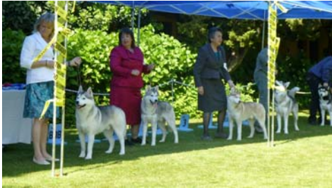
12-18 Month Dog Class

Set up for the weekend began Thursday with the setting up of grooming tents using canopies on loan to our club from the Bay Area Siberian Husky Club. Three canopies were set up and enclosed with side curtains to keep the dog hair contained. The canopies quickly multiplied on Saturday morning through the generosity of club members and exhibitors adding three more canopies making a spacious grooming area.