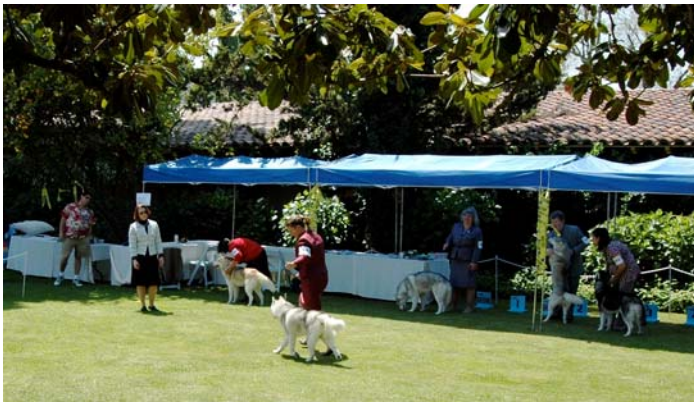
2013 NCSHC Specialty