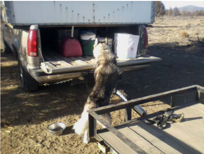
Wonder if there is some food in here?