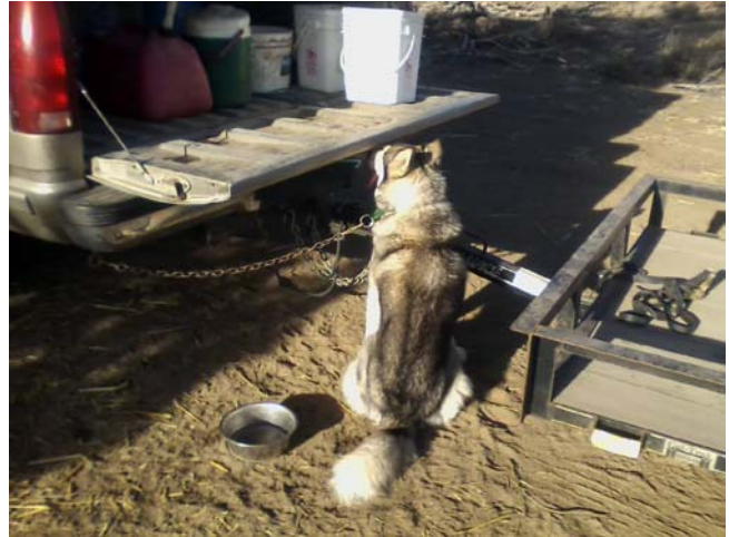
Hmm, this looks interesting