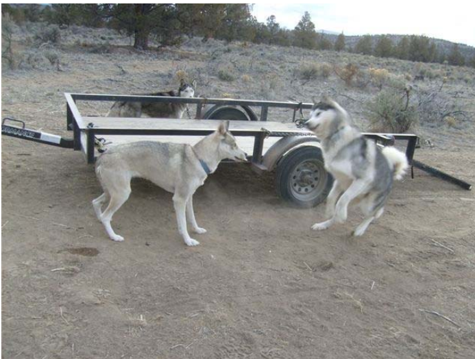
Meeting new friends