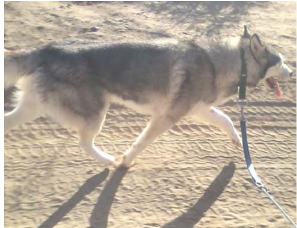
I think I am getting the hang of this!