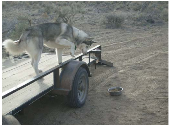
Now how do I get the food up here?