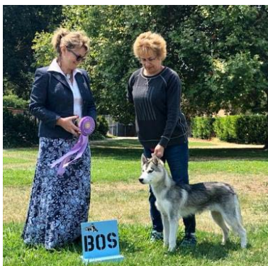
BOS Puppy - Artika-Couloir's Running Against the Wind