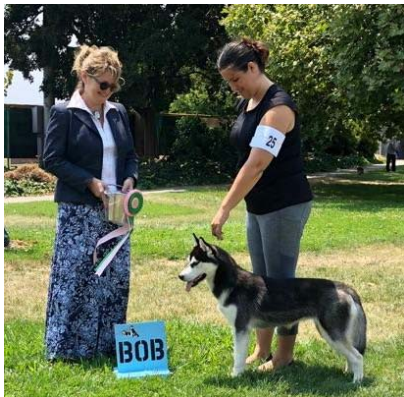
BOB Puppy - Couloir's Who Tells Your Story