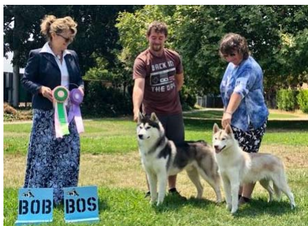
BOB Adult - Opium For Nanook Anrus House; BOS Adult - Sik-Itarad-Ad-Astra Anrus House