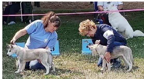
3-6 month puppy class