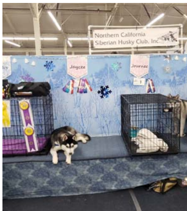
A good view of the bench with all the ribbons!