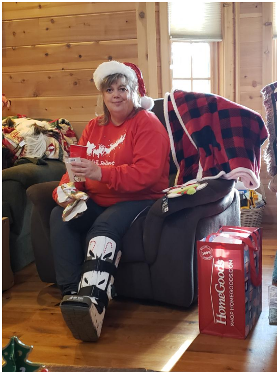
Fashionable boot decorated for Christmas