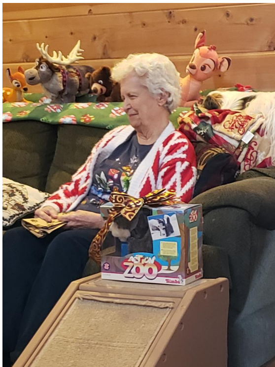
She didn't keep her gift very long!