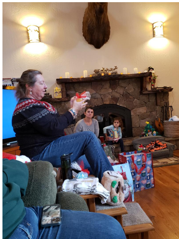
Hmm, something worth stealing?