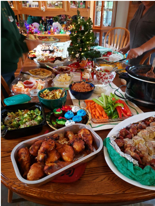
More food choices