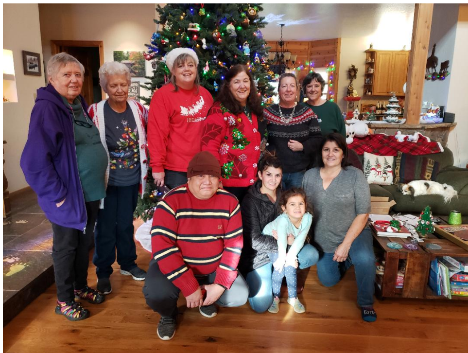
Happy Holidays from the Northern California Siberian Husky Club!!